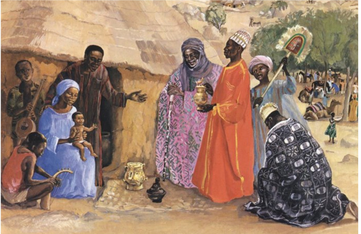
JESUS MAFA. Visit of the Three Wise Men . 1973.